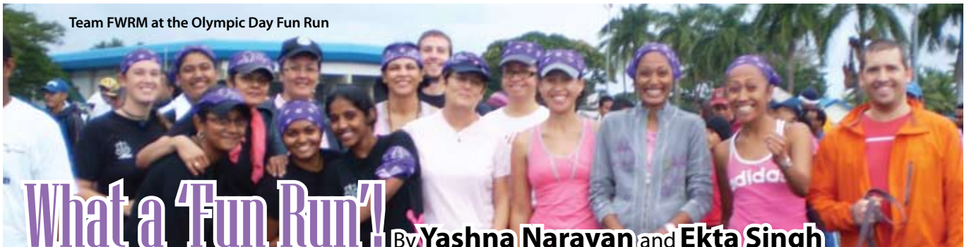
Team FWRM at the Olympic Day Fun Run

A civilised society like ours cannot afford to ignore such an issue. Women and girls' right to privacy, security and space is under siege. Eve teasing deserves to be tackled actively. Eradicating Eve teasing will help women access public places fearlessly, it will also prevent hurt, fear and humiliation of women, help prevent the mental agony that women go through, and will further gender equality in our country.