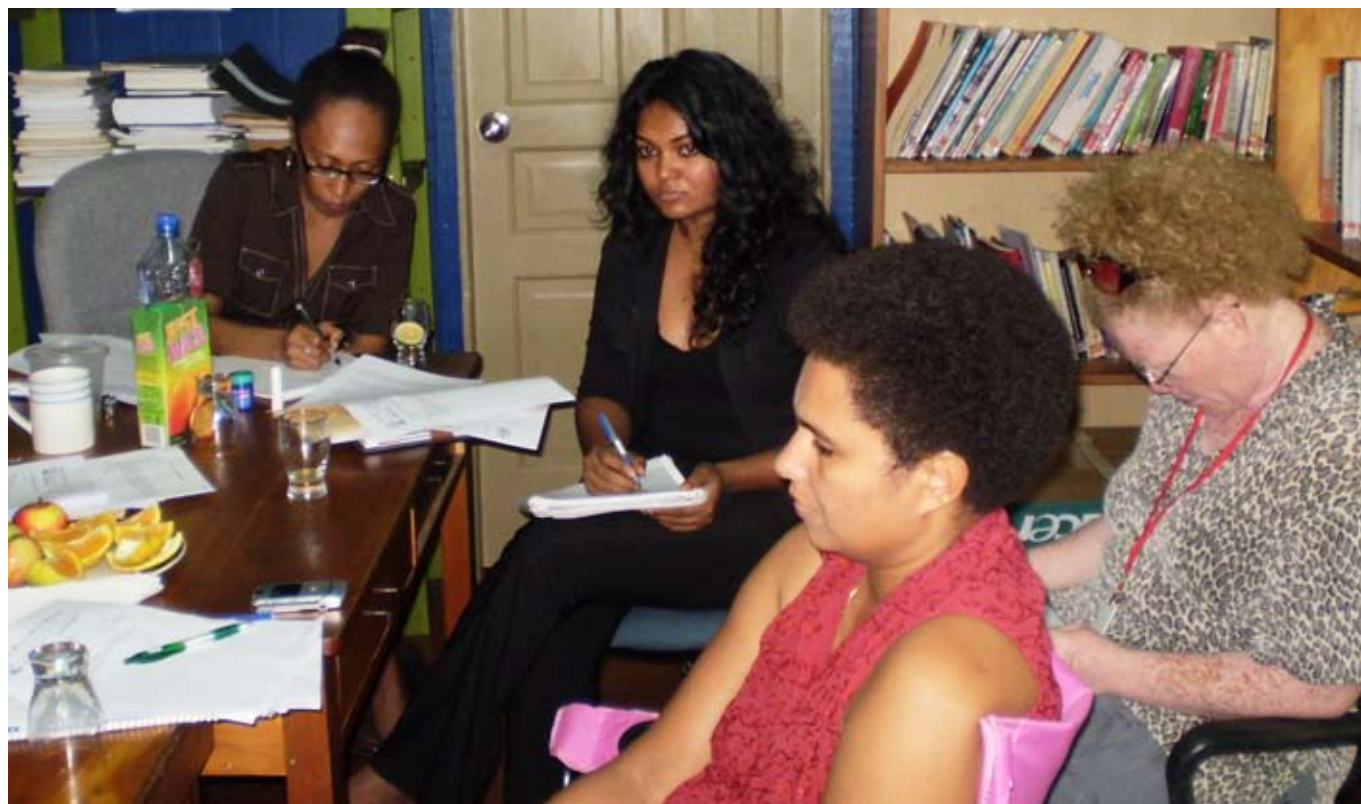
Members of the NGO CEDAW Advisory Committee meeting at the FWRM office

The NGO CEDAW Advisory Committee is a coalition of Fiji-based NGOs committed to enhancing the human rights of women through advancing the implementation of CEDAW. This NGO Committee developed out of an informal coalition formed in 1993 to lobby the Fiji Government to ratify CEDAW.