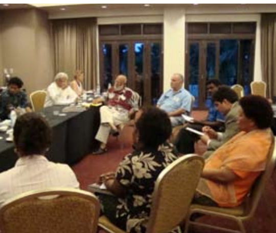
Hard conversations at the roundtable

At the end of the three day roundtable an outcomes document was agreed upon by the participants. Some of the issues that were in the document included a commitment to the United Nations Declaration on Human Rights, and a commitment to work together for transitional justice.