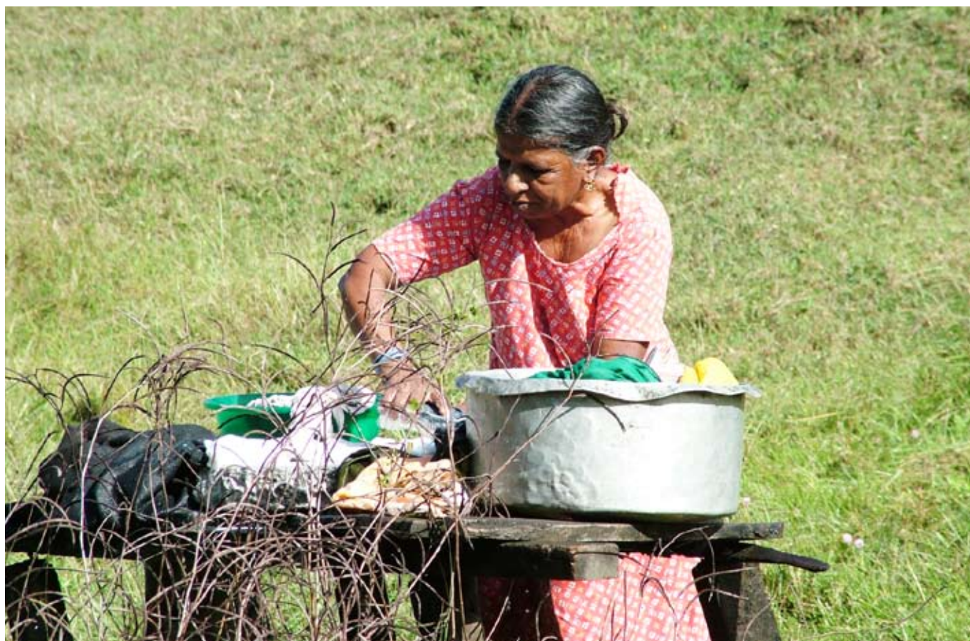
A woman washes her clothes at a well just outside Labasa

The highest incidence of poverty was for female workers in the Northern Division with 68%, 28% higher than those for men at 53%.