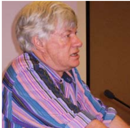
“Internationally respected human rights lawyer, Geoffrey Robertson Q.C. speaking at the Roundtable”.

According to the International Centre for Transitional Justice (ICTJ), this approach emerged in the late 1980s and early 1990s, mainly in response to political changes in Latin America and Eastern Europe—and to demands in these regions for justice. The ICTJ says at the time, human rights activists and others wanted to address the systematic abuses by former regimes but without endangering the political transformations that were underway. Since these changes were popularly called “transitions to democracy,” people began calling this new multidisciplinary field “transitional justice.” The ICTJ, assists countries pursuing accountability for past mass atrocity or human rights abuse. It was set up in April 2000.